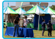
VIEW PHOTOS FROM THE ANNUAL SPRING EXTRAVAGANZA ON MAY 1

Students wrote policy arguments and produced podcasts about this topic and were excited to share their recommendations to the Academic Senate “AI” Ad Hoc Committee.